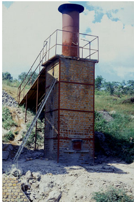
Figure 2: An improved vertical shaft kiln in Zimbabwe

Lime burners are generally seeking to produce the highest quality quicklime possible from their stone whilst keeping their production costs to a minimum. In the majority of cases, a very major production cost will be the fuel used. Thus, the efficiency of the burning process (as opposed to the whole process of production which will involve labour costs etc.) is judged by how much fuel it takes to produce a quantity of quicklime. For instance, a lime-burner may say "I produced X tonnes of quicklime using Y tonnes of coal which cost me Z dollars" . However, in order to compare different types of kilns using various fuels and producing quicklime of variable quality, it is necessary to develop a more universal measure of efficiency.