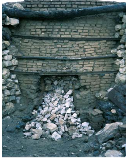
Figure 1: A traditional lime kiln in Sudan

Some limestones are dolomitic, that is they contain the mineral dolomite, \text{CaCO}_3\text{MgCO}_3 , in addition to the \text{CaCO}_3 which is present as the mineral calcite. Usually, pure calcitic limestones are preferable but dolomite can be tolerated provided the quicklime is well slaked before use.