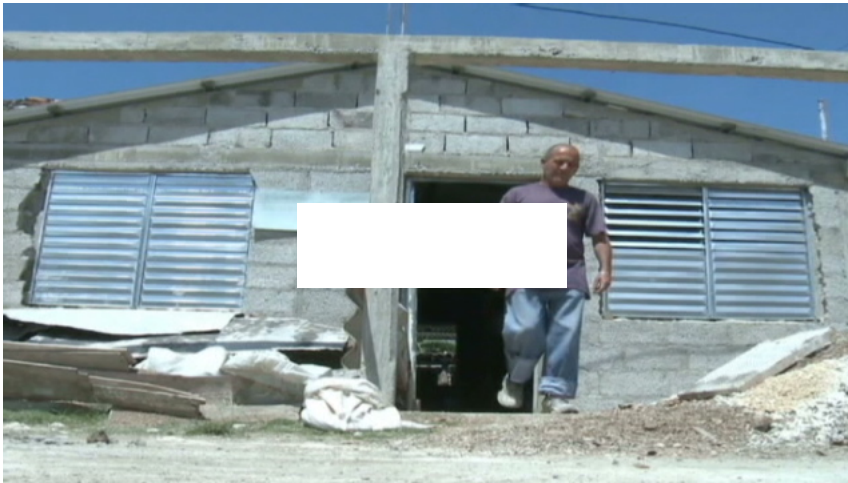
Cuba's storm-proof eco-houses

83 recommendations. Sign Up to see what your friends recommend.