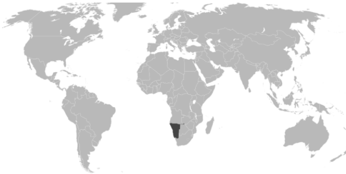
Fig. 1: Project location.