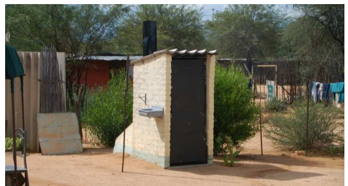
Fig. 3: Otji-toilet with attached hand washing basin

Against this background, the Omaruru Basin Management Committee decided to pilot 21 Otji-toilets in Omaruru (Fig.3). People living in the project area have no access to safe sanitation. Especially, for women and children, the traditional way of “going to the bush” is dangerous. During the rainy seasons, water related health problems such as diarrhoea are increasing. The project was planned as a pilot study to show that dehydration toilets with urine infiltration are an appropriate sanitation solution for the informal settlements of Omaruru, Namibia.