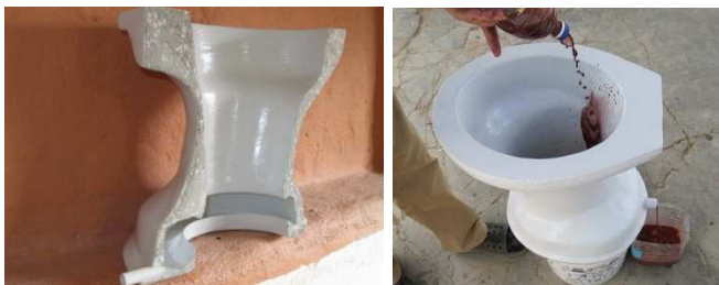
Fig. 4: Cross section of urine diversion bowl (left) where urine collects in the little trough at the bottom as demonstrated in urine diversion bowl (right) (source: CHP, 2009)

The toilet bowl is designed in such a way, that fluids touching the wall of the bowl are collected in a small chute and can be drained away through a pipe and separately infiltrates it into the ground (Fig. 4). No problems of blockages of the collection chute or the urine pipe, which is 20mm in diameter, have been reported.