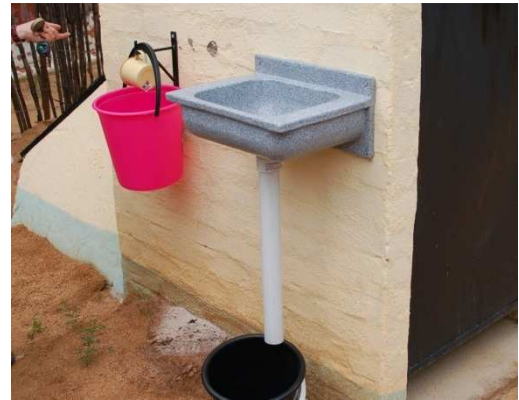
Fig. 6: Basic handwashing facilities attached to the toilets. The pink bucket provides fresh water, the cup is used to fill the basin and the black bucket collects the greywater which can be used for irrigation.

In addition to the construction of the toilets basic handwashing facilities were attached (Fig. 6) to the toilets with a handwashing instruction. To raise awareness among the population a dry-toilet and handwashing campaign was initiated.