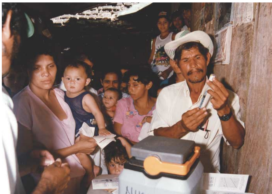
Fig 4 | Health workers in a village in Nicaragua.

One major point worth emphasizing is that true international partnerships require a huge investment of time from all participants—and are hugely rewarding in return. Clearly, ‘parachute science’, in which investigators from developed countries merely collect samples, return home and publish papers, is of no real use to scientists and citizens in developing countries. However, for the most part, teaching, mentorship and collaborations are not part of the institutional reward system in developed and middle-income countries, because tenure committees and funding agencies look only at the principal investigator of a grant and the first or last author on a publication. SSI is often called upon by groups in developed or middle-income countries that have the expertise to conduct training or workshops but lack the incentive to do so. Thus, in more developed countries, the value of teaching and mentorship needs to be underscored, and institutional reward systems that encourage international partnerships must be established. On the brighter side, there are numerous examples of thriving ‘North–South’ collaborations, even though the investment of time often comes at the expense of the investigators on both sides.