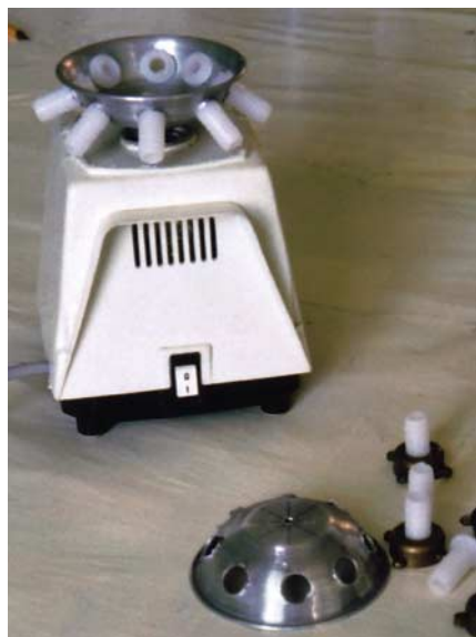
Fig 1 | The Bolivian 'blenderfuge' is an example of innovative ways to overcome equipment scarcity (designed and built by course participant Nataniel Mamani).

eventually in conducting relevant research and in training cadres of scientists in the process. The struggle only makes the success sweeter, and all progress, no matter how small, is a big step forward.