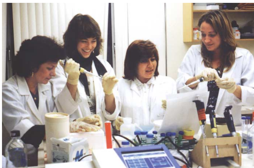
Fig 2 | The author (second from left) teaching participants sample extraction in preparation for PCR in a workshop in Ecuador.

However, building scientific capacity is much more than just technology transfer. Technical aspects are, of course, fundamental, but it is a mistake to regard the process as mere training in laboratory skills. In our view—at least in the area of infectious disease research—laboratory techniques should be taught alongside epidemiological skills to provide a framework that helps researchers using new diagnostic or strain-typing assays to understand local disease patterns and design effective interventions. In all areas of science, however, grant-writing skills are invaluable. We therefore structure our workshops to include training in laboratory, epidemiology and proposal development skills. This includes instruction on ethical review processes and training in how to prepare human-subject protocols and letters of consent.